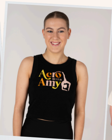
Black Ribbed Crop