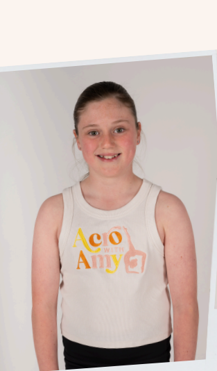
Crew Ribbed Crop