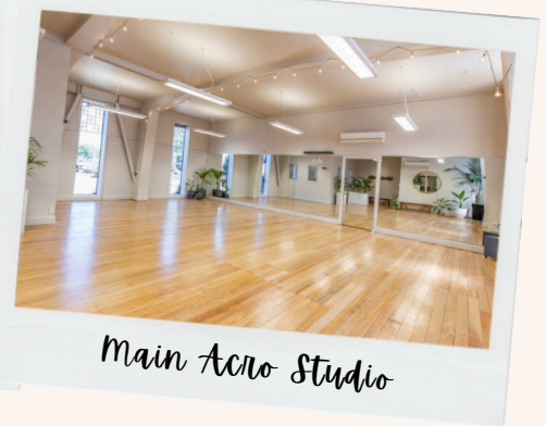
Main Acro Studio